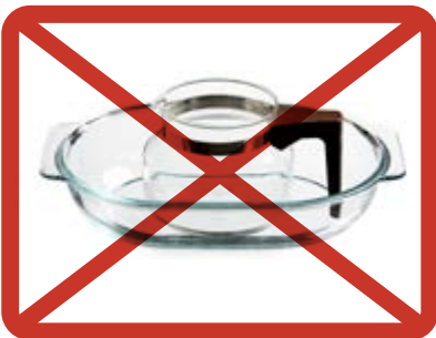
Glassware » mixed waste

glass dinnerware, serving dishes and other glassware, bulbs, china or ceramics.