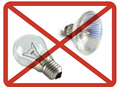
Halogen light bulbs and traditional incandescent bulbs » mixed waste