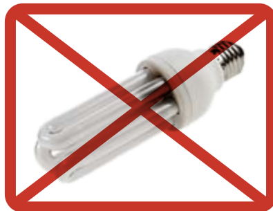
LED and energy saving bulbs, fluorescent tubes » electric equipment or hazardous waste