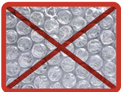
Bubble wrap » plastic packages

bubble wrap, polystyrene, gift paper, book covers, plastic bags.