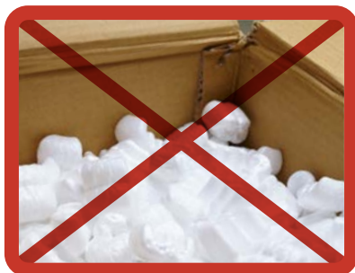
Packaging polystyrene » plastic packages