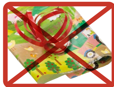
Gift paper » mixed waste