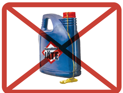
» hazardous waste