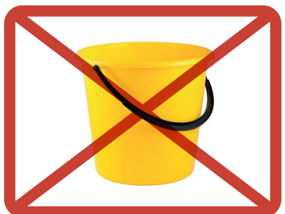
» mixed waste or plastics collection at Sortti-stations

No thanks: Items other than packages such as toys, kitchen utensils. Packages with residues of hazardous substances.